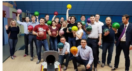
IEEE IES Young Professionals & Student (YPS) cooperation inside Society and outside of the Society; IES YPS party at bowling.